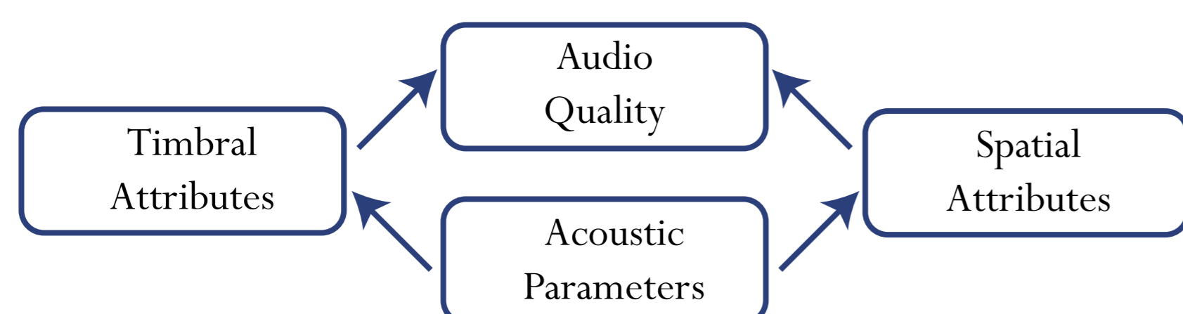
Figure 1. Audio quality depends on timbral and spatial attributes of sound which, in turn, depend on objective acoustic parameters.

Each timbral and spatial attribute relates to one or more acoustic cues, such as spectral slope, relative harmonic amplitudes, inter-aural signal relationships, and reverberation level [Zwicker & Fastl 1999; Blauert 1997]. Determination of the exact relationships between acoustic cues and perceptual attributes is an ongoing research task since these relationships can be more intricate than they may initially appear and a relationship that holds for one particular category of sound sources may not hold for another. Inter-aural cross-correlation coefficient, for example, is an important cue for source width perception but this percept is also influenced by several other factors [Mason et al 2005]; perceived softness is often correlated to harmonicity, but this is not always the case [Williams & Brookes 2009]. The relationships between objective acoustic parameters, perceptual attributes and overall audio quality is summarised in figure 1.